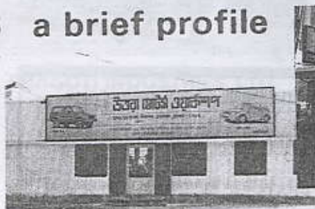
(1) Uttara Motors Work Shop (2) Uttara Motors Show-Room Cum Head Office