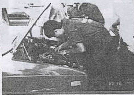
Maruti Clinic, Uttara workshop Mechanics attending Maruti vehicle

Uttara Motors sold about 200 units directly to customers and 100-units through