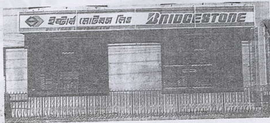
Eastern Motors new Show-room in Bijoy Nagar, Dhaka.

Eastern Motors Ltd., Sole Distributor for Japan's renowned BRIDGESTONE-Tyre, had its age-old branch in Gulistan Building in Dhaka now a very crowded place. But with growing need and to facilitate better customer-service, a branch in an ideally-located spot for marketing "BRIDGESTONE" in this busiest-city of the country was envisaged long before. Accordingly the new branch was established at "SATTAR BHABAN, 3 B-E, Bijoy Nagar, Dhaka-