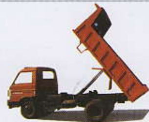
New SML Isuzu Dump Truck