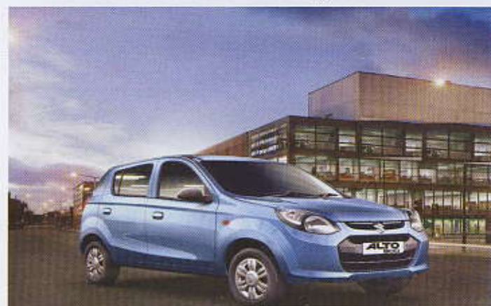
Passenger car of New Suzuki ALTO 800 cc