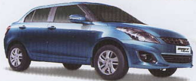
New Swift Desire now in Bangladesh