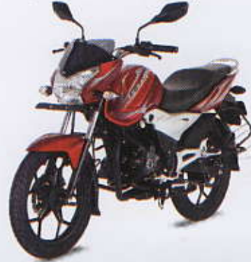
Launching of Bajaj New Discover 125 cc ST Motorcycle