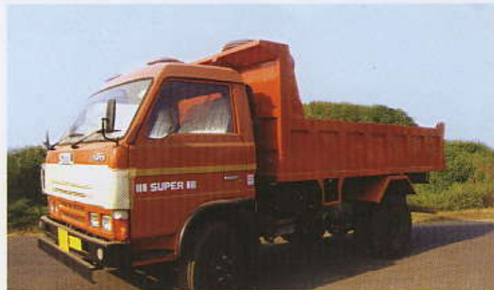
Introducing the new SML Isuzu Dump Truck

Over the years Uttara Motors Limited has been introducing a wide product portfolio that has covered regular as well as special segment needs. Recently the company has started marketing Swaraj Mazda Isuzu Dump Truck especially built for large goods with wide and comfortable cabin. SML dump truck produced by Swaraj Mazda, India which symbolizes the best Indian technology and engineering attached with R & D and innovation edge on global scale. 4 cylinders, OHV compliant engine, Diesel, Maximum output:101Bhp/3000 rpm, Maximum torque: 270 Nm/1750-2000 rpm, Dimension: LxWxH :3277 mm X1905mm X 560 mm, Transmission: 5 Forward all synchromesh 1 reverse, Body capacity: 3.5Cum/124cft and two Hydraulic Cylinder (Na), Turbo charger and Auxiliary gearbox make it more acceptable.Box type chassis with tubular cross members to carry more load, provide better strength and rigidity. The Dump truck excels at providing owners with a range of cargo bed options to suit the application. This dump truck steel chassis and galvanized metal bed are reinforced to handle the extra stresses on the vehicle.The multiple utility options of the SML Isuzu Dump Truck maximize productivity by giving the customer the best possible deal.