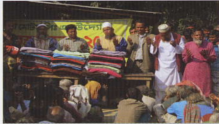
Corporate responsibility of Uttara Group of Companies (Quilt distribution among cold stricken People at Dinajpur and Rangpur'2013)

In the month of December 2012 a devastating cold wave hit the country's south west region, it left behind a trail of destruction affecting many lives. Uttara Group of companies responded promptly to this social disaster and distributed relief quilts among the cold stricken people. Branches of Dinajpur, Rangpur, Bogra and Barisal offices were helped by high officials of local government and members of Joint Force in distributing the relief quilts.