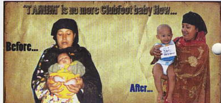
Lion Mukhlesur Rahman Foundation (A milestone in treatment of Clubfoot and Cleft Children)

2. Bring every clubfoot child under treatment within the month of life and achieve full correction before the starts walking. ZCF touched a remarkable milestone of 1500 clubfeet under correction within 30 months. More than 1100 patients have been treated under ZCF. Among them more than 750 patients were fully recovered. The principal aim of the program is to develop the Ponseti technique in the Government health system.