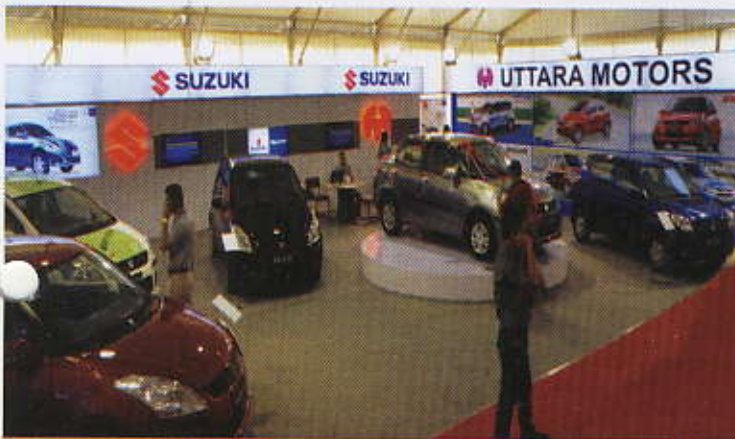
Suzuki new Dzire and ALTO on display in the Motor Show