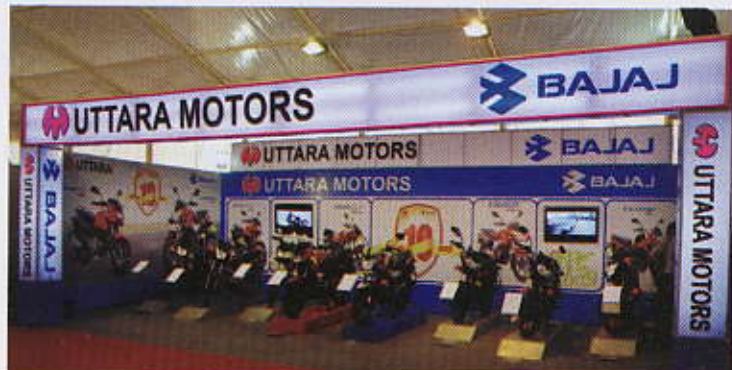
Bajaj Motorcycle on display in the UML pavilion at Dhaka Motor Show

Beside Bajaj 125cc Discover DTSi ( Digital Twin Spark Ignition) Motor cycle with alloy wheel, S-n-S suspension and attractive decals, CT100cc, Platina 100cc, 125cc, Pulsar 135 cc and Pulsar 150cc were also appreciate by people greatly admired by people who opts for fuel efficiency. Discover 100cc can give up to 80 KMPL under standards test condition.